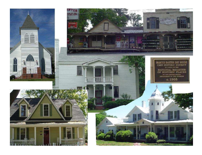
Want to learn about these and other historic properties in the Cary area? Come to our May 22 program!

Free and open to the public Light refreshments served