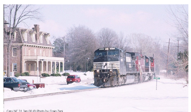
Photo © 2001 by Craig Zeni. Used with permission. See more of Craig's train photos at http://www.trainweb.org/zeniphotos/zenihome.html

The Friends are seeking a few good board members. Our nominations committee solicits candidates for several seats on the board of directors. Elections will be held in June.